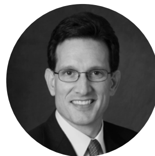
Eric Cantor Former Majority Leader of the U.S. House of Representatives Vice Chairman & Managing Director Moelis & Company