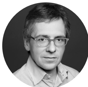
Ian Bremmer President Eurasia Group

Societal disruption continues to rattle global hotspots like Syria, Venezuela and Turkey, but also is rattling the old order of stability, like the United Kingdom, France and United States. One panellist has described 2017 as entering a "geopolitical recession." Is the present that stark? Is there a near-term geopolitical re-awakening of an international order or is nationalism here to stay for the foreseeable future?