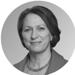
Inga Beale Chief Executive Officer Lloyd's

Chaired by Inga Beale | Chief Executive Officer | Lloyd's